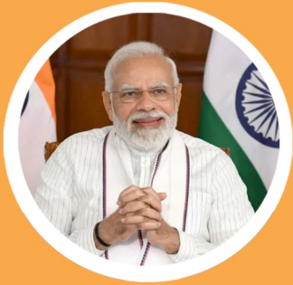
Shri Narendra Modi Hon'ble PM of India President, CSIR