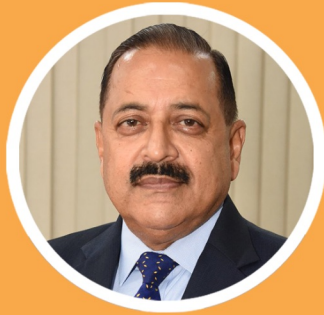
Dr. Jitendra Singh Hon'ble Minister (S&T) Vice President, CSIR